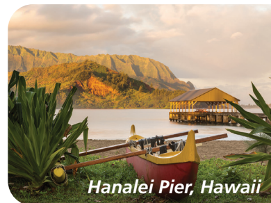
Hanalei Pier, Hawaii