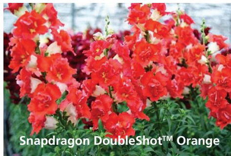
Snapdragon DoubleShot™ Orange