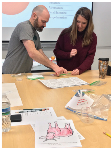
Scenes from our Teacher Institute Day workshop

February was a month of many topics! Students learned about soil, livestock, dairy, corn, specialty crops, and pizza! This month our #1 lesson topic was pizza. Our classes learned about the different pizza ingredients and the plants and animals that they come from. Students got to grind flour, view our dairy cow milker videos, and make their own paper pizzas to take home. At the office, entries for our 2023 Bookmark Contest "My Favorite Food" have been coming in! We're excited to choose our winner later in the month. We've also just completed our 2023 Teacher Institute Day workshop and had an amazing time teaching local educators about a wide range of agriculture topics.