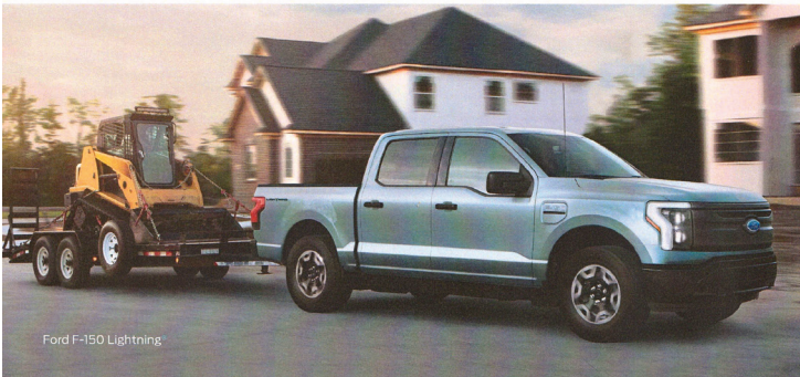
Ford F-150 Lightning

Farm Bureau Members Receive a $500 Exclusive Cash Reward* on an Eligible New Super Duty®, F-150®, Ranger®, Maverick®, or F-150 Lightning®