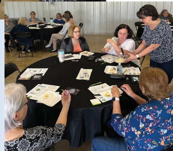
Presenters and participants discussed food safety at the April Food Science 101 event.